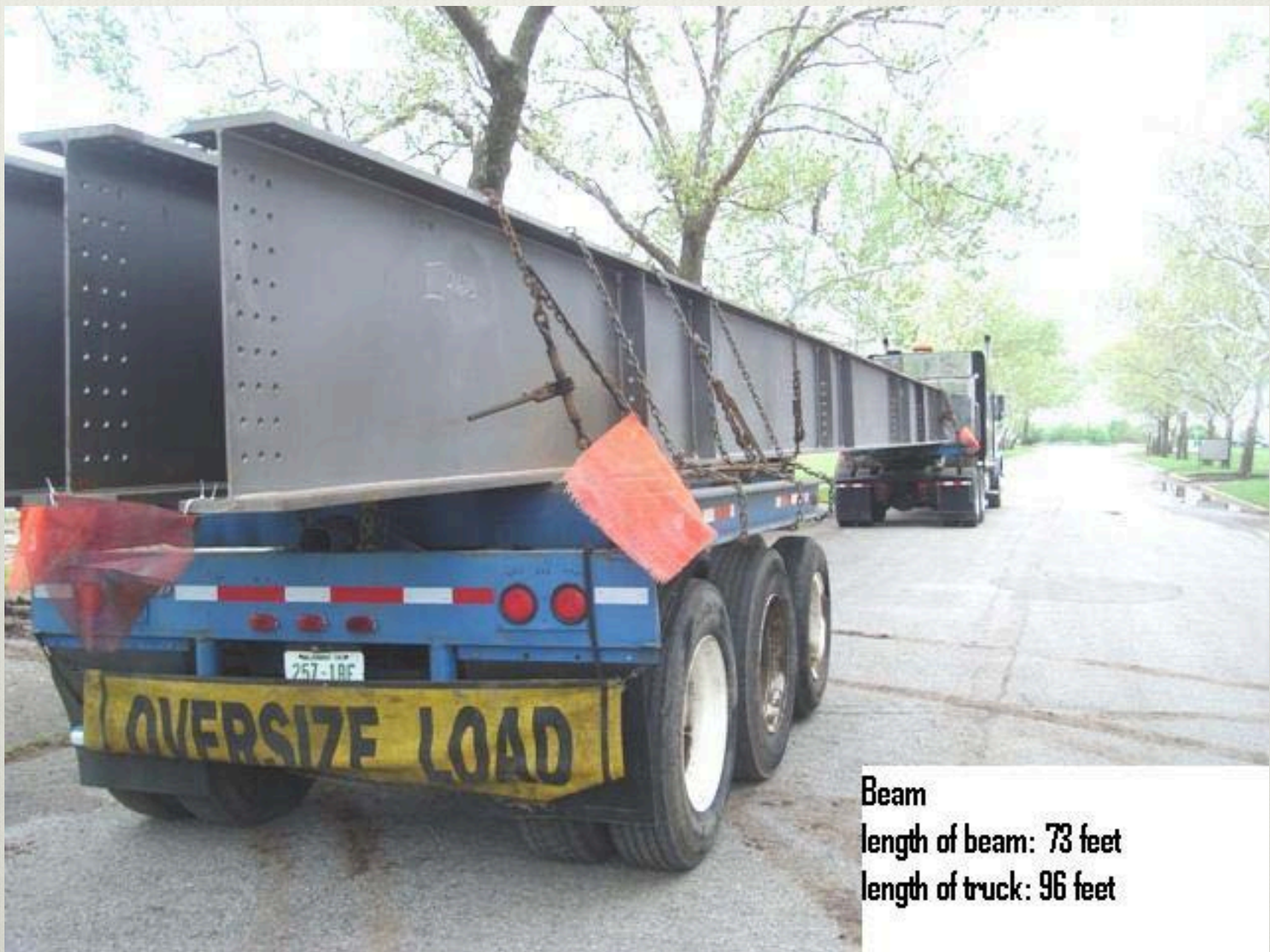
Beam length of beam: 73 feet length of truck: 96 feet