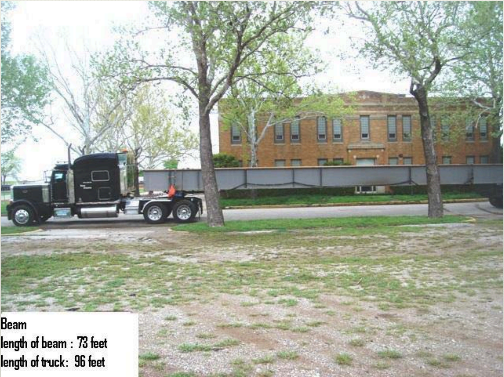
Beam length of beam : 73 feet length of truck: 96 feet