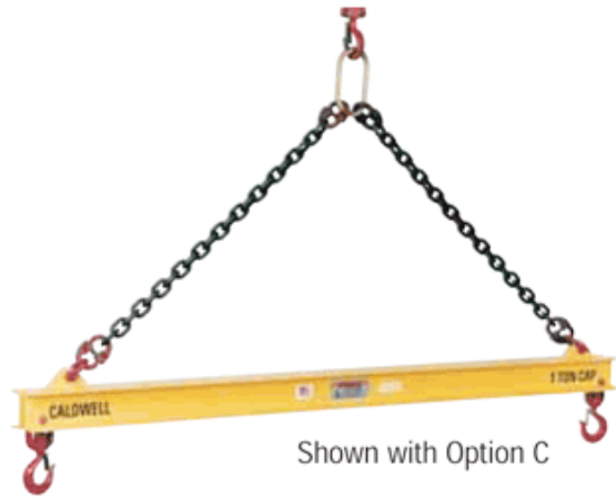
Shown with Option C Specify Top Rigging